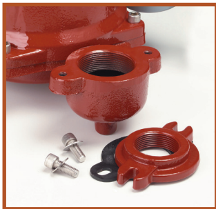
Dual Sized Discharge 1-1/2" or 2"

For use with ISS-Series and ISD-Series intrinsically safe control panels. Consult factory for proper control panel sizing.