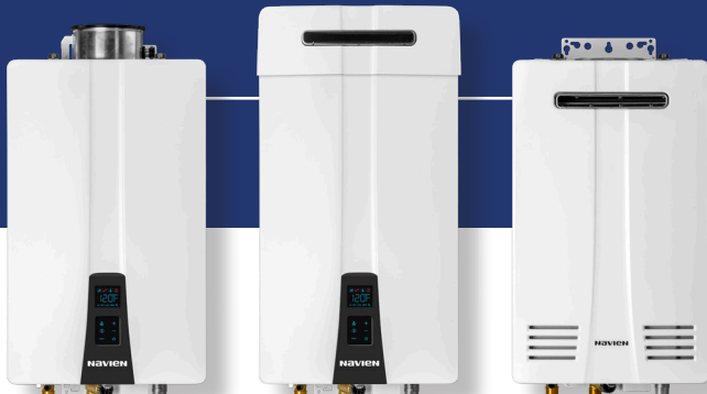
NPN-Universal indoor version