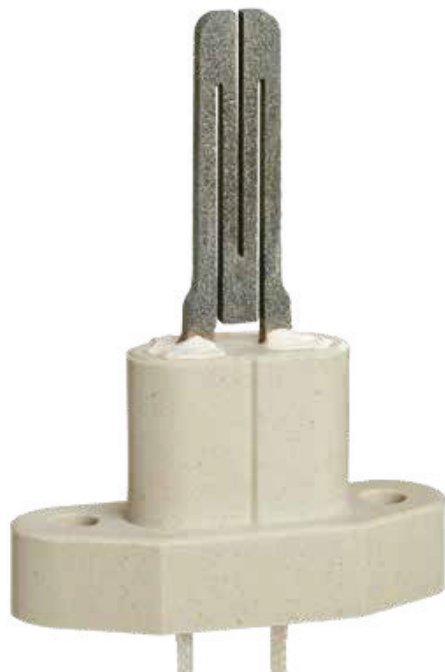
Q4100C9050 Lead wire = 11" Stripped Ends