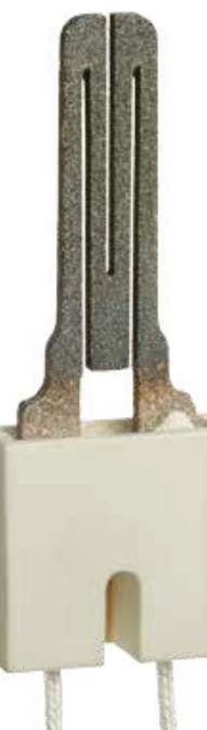
Q4100C9058 Lead wire = 4.5" Molex Front Lock