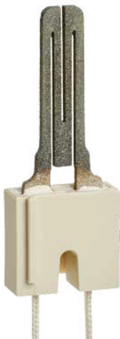
Q4100C9068 Lead wire = 5.25" Receptacle