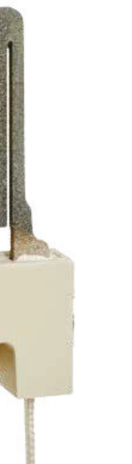
Q4100C9070 Lead wire = 5.668" Female Quick Connect