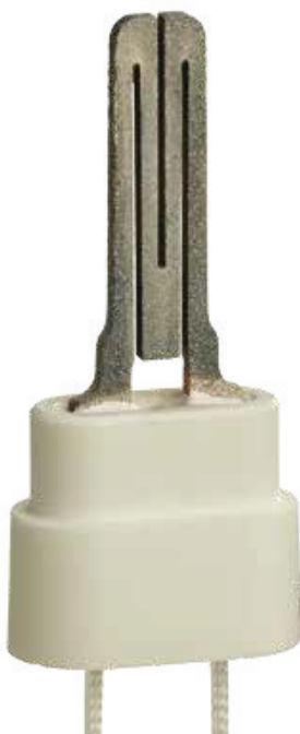
Q4100C9042 Lead wire = 5.5" Molex Internally Keyed