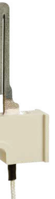
Q4100C9056 Lead wire = 5.25" Receptacle