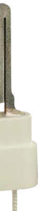
Q4100C9044 Lead wire = 6" Receptacle