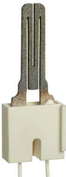
Q4100C9040 Lead wire = 5.25" Receptacle