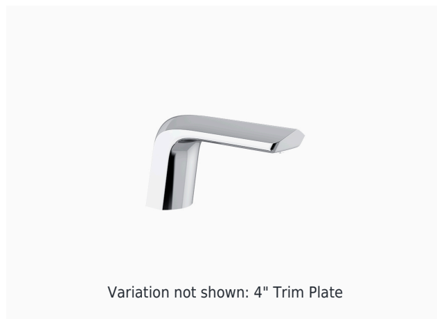
Variation not shown: 4" Trim Plate