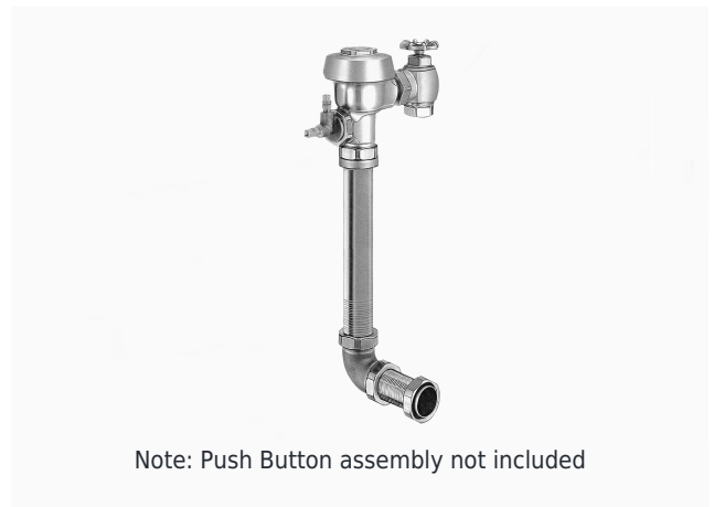
Note: Push Button assembly not included