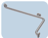
■ CareGiver® Safety Grab Bar Model 390.304