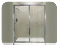
■ StyleMate® Enclosures See page 14 for Framed & Frameless models