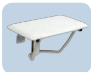
■ CareGiver® Fold-Down Shower Seats Models 390.413