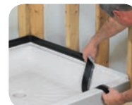
■ GapSeal-Pro™ Model 60.320A