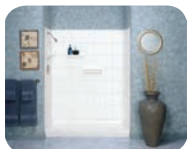
■ DURAWALL® Shower Walls; 572T, 760T-30WHT, 260 & 265