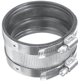
1 1/2" - 4"