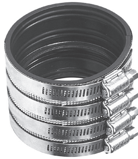
5" - 10"