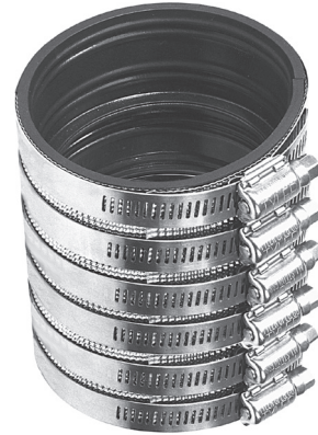
12" & 15"