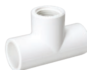
Tee SLIP x SLIP x FPT