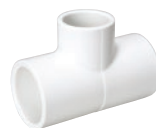
Reducing Tee SLIP x SLIP x SLIP