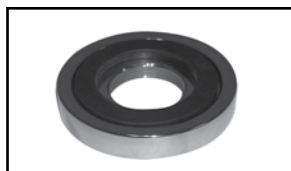
343 SPACER RING 10B OIL RUBBED BRONZE 15S SATIN NICKEL