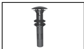
499 LAVATORY DRAIN, W/OVERFLOW 26 POLISHED CHROME

Available finishes are shown below item number