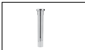
328 EXTENSION TUBE 10B OIL RUBBED BRONZE 15 POLISHED NICKEL 15S SATIN NICKEL 26 POLISHED CHROME 56 FLAT BLACK