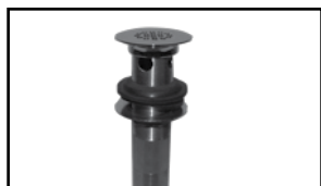
3211 LAVATORY DRAIN, W/OUT OVERFLOW 07 ENGLISH BRONZE 10B OIL RUBBED BRONZE 15 POLISHED NICKEL 15A ANTIQUE NICKEL 15S SATIN NICKEL 20 STAINLESS STEEL (PVD) 26 POLISHED CHROME 56 FLAT BLACK