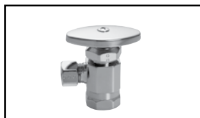
401 ANGLE VALVE, 1/2" IPS 10B OIL RUBBED BRONZE 15 POLISHED NICKEL 15S SATIN NICKEL