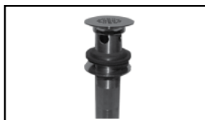
3213 LAVATORY DRAIN, POLISHED W/OUT OVERFLOW 10B OIL RUBBED BRONZE 15S SATIN NICKEL 26 POLISHED CHROME