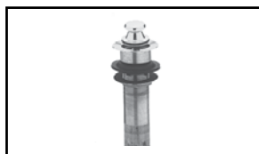
3201 LAVATORY DRAIN, W/OUT OVERFLOW 10B OIL RUBBED BRONZE 15 POLISHED NICKEL 15S SATIN NICKEL 20 STAINLESS STEEL 26 POLISHED CHROME