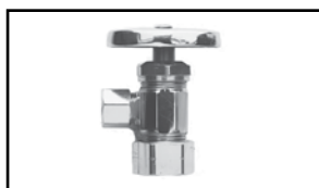
403 ANGLE VALVE, 1/2" COMPRESSION 03 POLISHED BRASS COATED 06 ANTIQUE BRASS 07 ENGLISH BRONZE 10 SATIN BRONZE (PVD) 10B OIL RUBBED BRONZE 15 POLISHED NICKEL 15A ANTIQUE NICKEL 15S SATIN NICKEL 20 STAINLESS STEEL (PVD) 26 POLISHED CHROME 56 FLAT BLACK