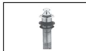
3203 LAVATORY DRAIN, POLISHED W/OUT OVERFLOW 10B OIL RUBBED BRONZE 15S SATIN NICKEL 26 POLISHED CHROME