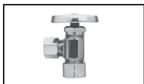
402 ANGLE VALVE, 1/2" COMPRESSION 10B OIL RUBBED BRONZE 15S SATIN NICKEL