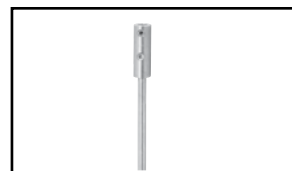
3251 LAVATORY DRAIN LIFT ROD EXTENSION