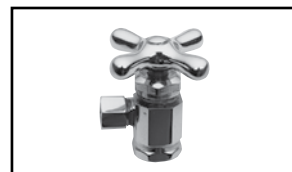
401X ANGLE VALVE 1/2" IPS 15 POLISHED NICKEL 15S SATIN NICKEL 26 POLISHED CHROME