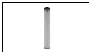
327 LAVATORY DRAIN TAILPIECE 10B OIL RUBBED BRONZE 15 POLISHED NICKEL 15S SATIN NICKEL