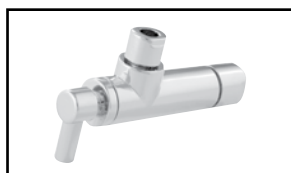
403-1 ANGLE VALVE, 1/2" COMPRESSION 15S SATIN NICKEL 26 POLISHED CHROME