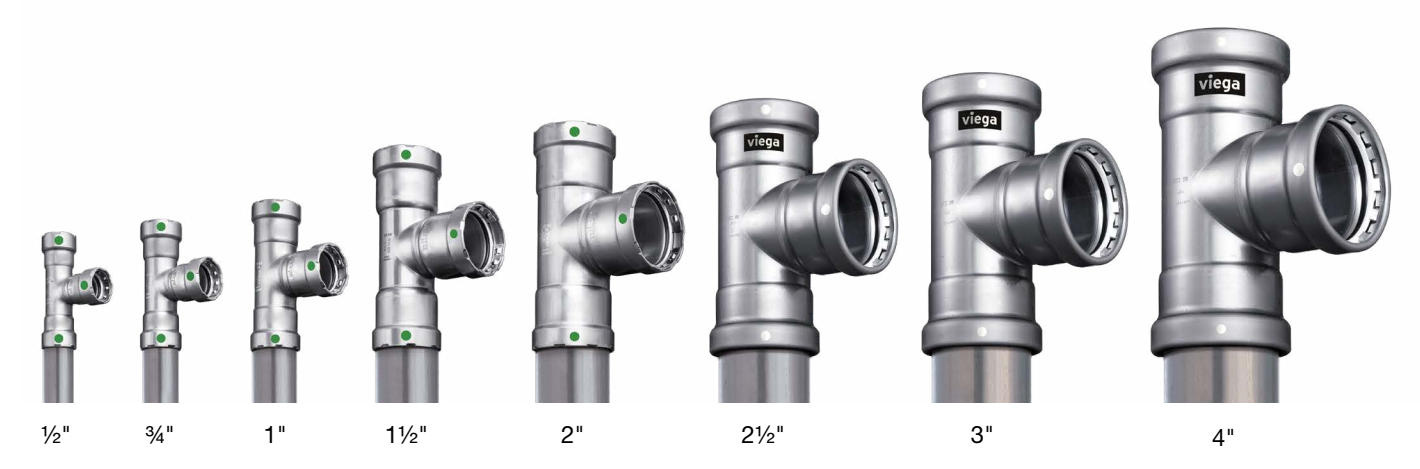
MegaPress fittings for IPS stainless steel pipe are available in sizes from 1/2" to 4".

For new construction, renovation and repair work, Viega MegaPress fittings deliver up to 90% installation time savings compared to welding and threading. MegaPress Stainless will minimize downtime on MRO projects and keep new projects on schedule.