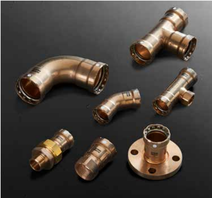
Viega MegaPress CuNi