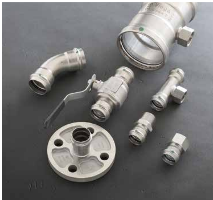
Viega ProPress 316