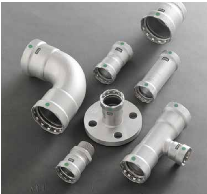
Viega MegaPress Stainless

Viega MegaPress is UL and FM certified for fire protection applications in sizes ½" to 2". As with other Viega press systems, Viega MegaPress fittings can be used in pre-fabricated assemblies, producing a straight, clean installation. And with patented Smart Connect technology, installers can verify that all fittings in pre-fabbed assemblies are secure.