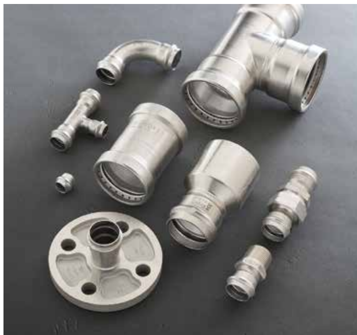
Viega ProPress 304

For a list of applications, please reference the chart on page 15.