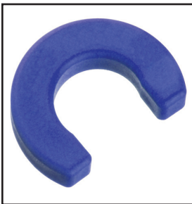
FIGURE 2 - TECTITE™ Removal Tool

The following removal procedure is used for the 1/4" thru 1" TECTITE™ fittings and all compatible tube materials.