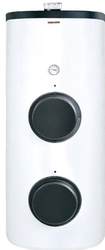
SBB 300/400 E