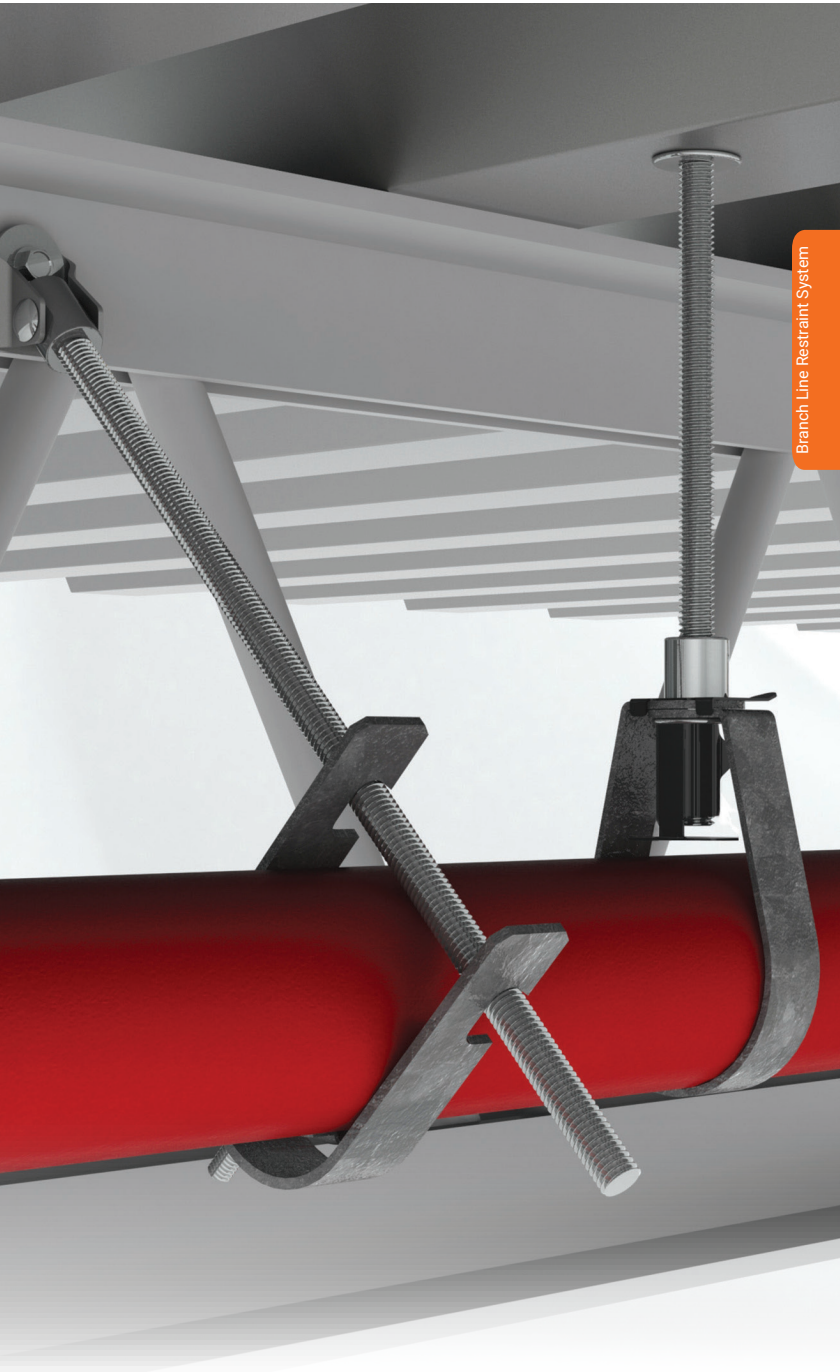
Branch Line Restraint System