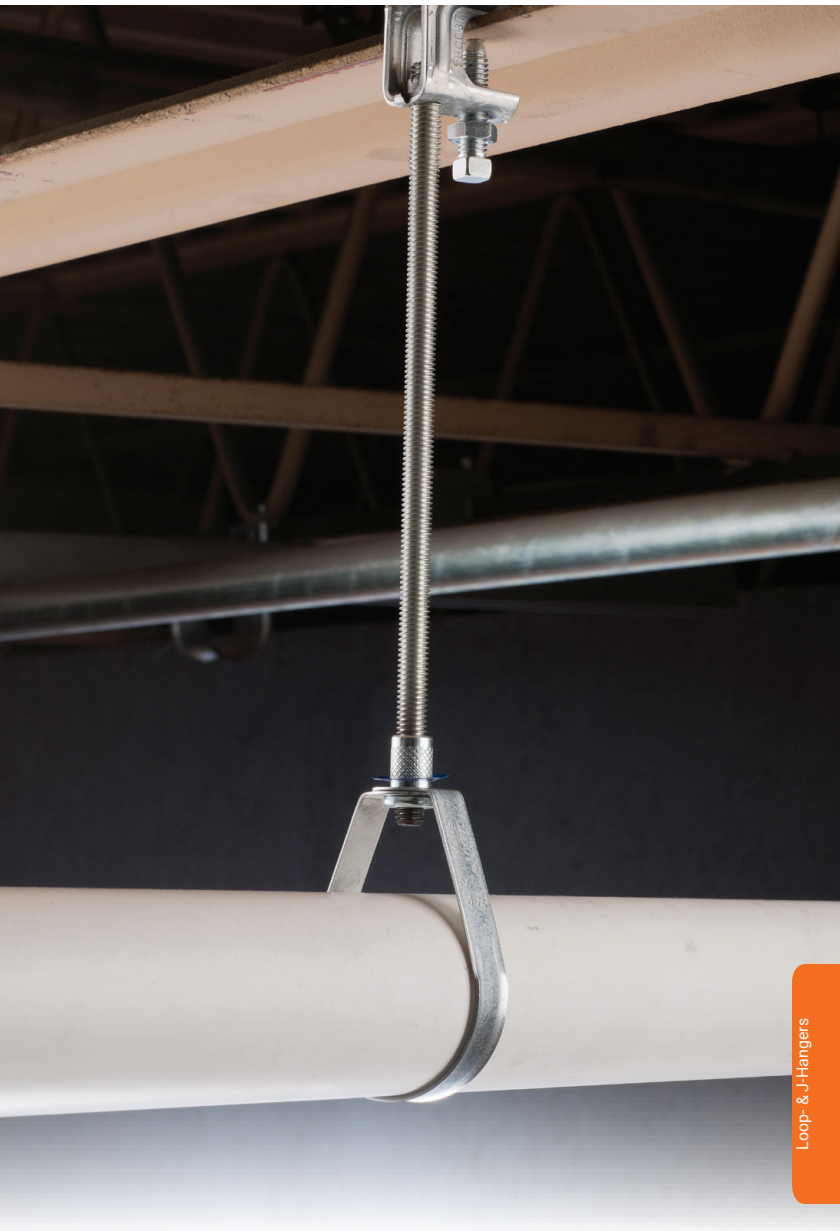
Loop- & J-Hangers