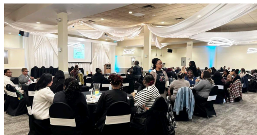
Community Health Workers during the Summit

One of the major challenges faced by non-U.S. citizen immigrants, he explained, is the reduction in access to food assistance programs such as food stamps. In response, Ebenezer Healthcare Access is working closely with local food pantries to help ensure that immigrants and refugees do not suffer from food insecurity.