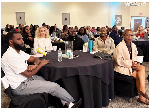
EHA CHWs and Staff

Ebenezer Healthcare Access, a nonprofit organization dedicated to improving the lives of immigrants and refugees by breaking down language and cultural barriers to health equity—particularly in the cities of Cincinnati,