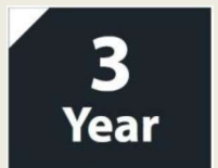
Light Commercial Warranty