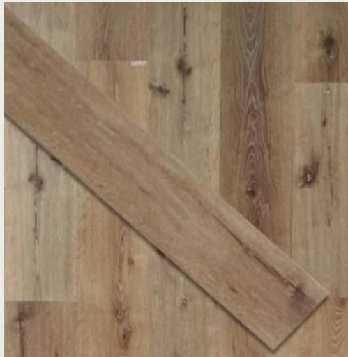
5524392 Rustic Cypress

High Density Rigid Composite Core (4.0mm)