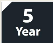
Light Commercial Warranty