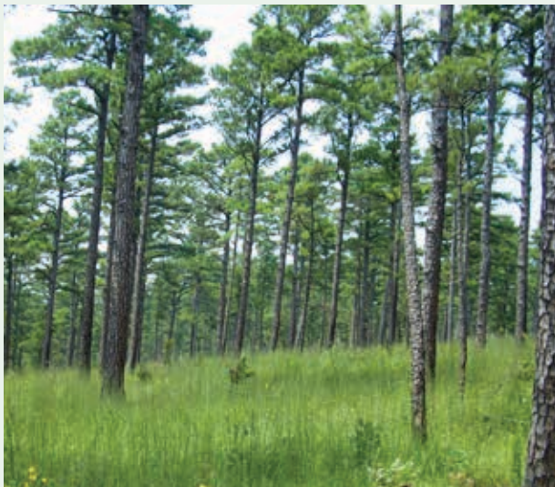
Pine bluestem restoration on the Mena Ranger District.

The shortleaf pine–bluestem ecosystem restoration project began in 1991 on the Ouachita National Forest. The purpose is to restore ecosystem function to this community in the Ouachita Mountains of Arkansas and Oklahoma. Management actions include prescribed burning, timber harvest, both thinning and regeneration, midstory reduction and milkweed plantings to enhance restoration of monarch populations. Management actions were coordinated with a massive research effort involving the Forest Service Southern Research Station and numerous colleges and universities. This allows the Ouachita National Forest to adapt its management based on sound science. Total project area is almost 320,000 acres, with about 116,000 acres already in a restored condition and many more acres in different stages of restoration.