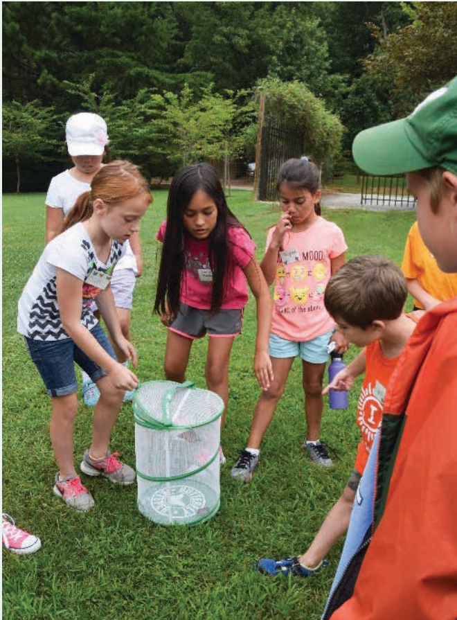
Fayetteville butterfly camp.