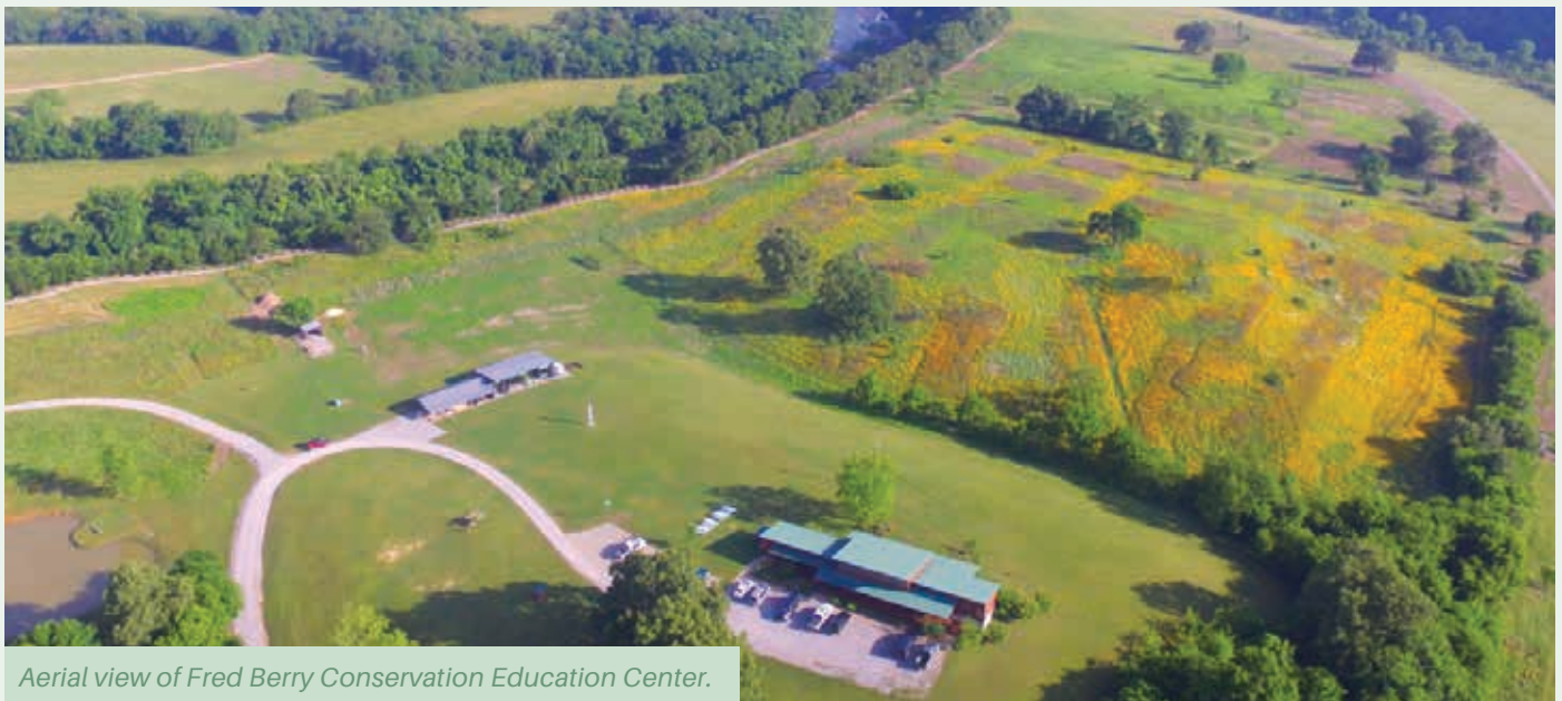
Aerial view of Fred Berry Conservation Education Center.

of assorted species of milkweeds were planted on 10 acres dedicated specifically to enhancing monarch and pollinator habitat, with 50 more milkweed plants added later. These milkweed plantings had a significant success rate and monarchs, eggs and caterpillars, as well as a variety of other pollinator species, have been observed on them. Other forbs in the dedicated 10-acre pollinator plot include coreopsis, black-eyed Susan, bee balm, yarrow, coneflower and more.