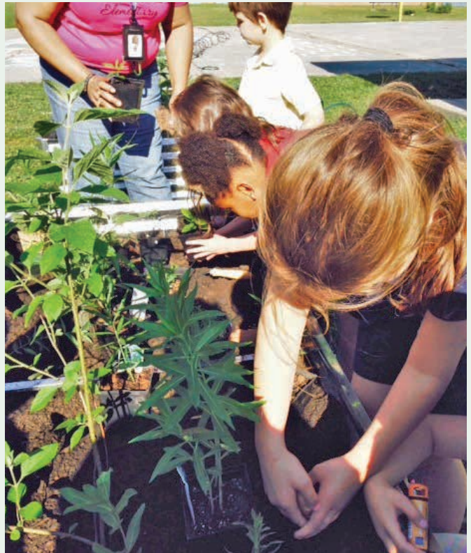
Pulaski Conservation District, NRCS School Pollinator Gardens.

The bed installation and plantings were completed in spring 2017. Ten beds were installed in the Flightline Academy Middle School outdoor