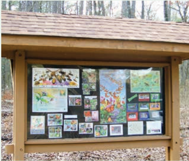
Kiosk at Ouachita National Forest Pollinator Garden.

The Fourche Pollinator Garden was developed as part of the Monarch Joint Venture project to provide host plants and nectar sources to various butterflies, pollinators and other wildlife species. This garden is designed around an old log landing that is the center of the garden opening. A woodland vernal pond was created to provide breeding habitat for dragonflies and amphibians, and to provide educational opportunities. As the pond dries in the summer, it creates mudding areas for the butterflies and water for other pollinators. A concrete accessible trail was created that winds approximately 780 feet and has various animal footprints stamped across it for education. This garden is small but has a variety of local plants that were planted in the garden, and the paved trail in the surrounding woods offers other opportunities to view additional plant species in their natural setting.