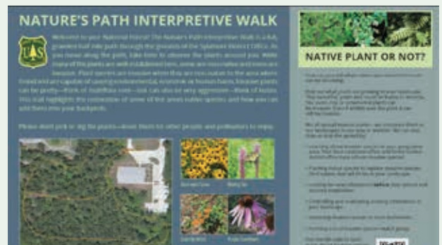
Nature's Path Interpretive Walk sign at Sylamore Ranger District Office Pollinator Garden.

Through a grant from the Joint-Chief's Landscape Restoration Partnership between the USDA NRCS and the USDA Forest Service, the Sylamore Ranger District of the Ozark-St. Francis National Forests designated an eight-acre area adjacent to the Ranger Station as an interpretive site in 2015. This area includes a half-mile nature trail and a native pollinator garden that is open to the public. The objective of the interpretive area is to show the public an example of ecological restoration. The site has undergone invasive species treatments, mechanical treatment of woody species, prescribed burns, and native species planting. Several signs like the one below will be placed along the trail with information on invasive species, ecological restoration, native wildflowers, native pollinators, and land management.