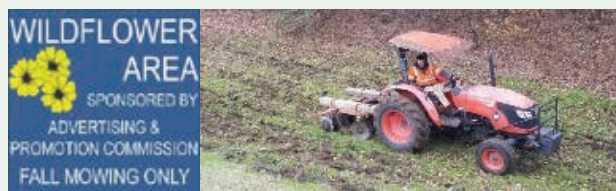
Operation wildflower sign and U.S. Highway 49 in Helena-West Helena Operation Wildflower site preparation.

The Helena-West Helena Operation Wildflower project received two signs, at the beginning and end of the planted area. Also, in exchange for the seed donation, AHTD did all the site prep work—mowing, disking and sowing of seeds. Cooperation from the local District maintenance personnel is helpful, as they usually come out and help us prep the ground for sowing seeds, and it alerts the Districts where the wildflower plot(s) is, so that they don't mow the area at the wrong time of year.