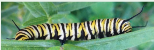
Monarch caterpillar on planted butterfly weed.

The Preserve is open to the public, and signage, natural trails, and a canoe access have been added to the property to provide a positive visitor experience. Conservation, science, and school groups utilize the property as an outdoor classroom and numerous visitors hike, fish, bike, and explore.