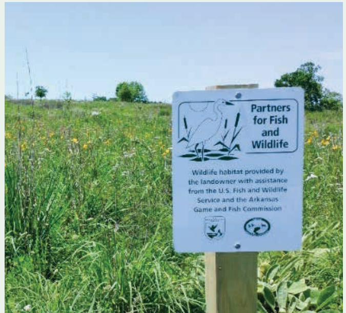
Native grassland/savanna habitat.

Through a series of herbicide applications and prescribed burns, and drilling seeds of a standard native grass and forb mix, the property was gradually transformed into a diverse native habitat rich in species diversity. Over 100 plugs