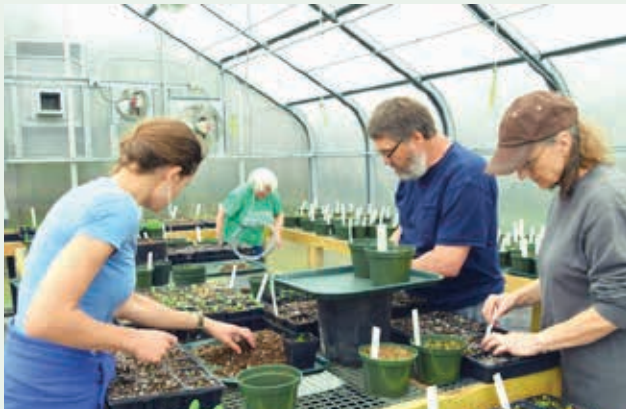
Master Naturalists planting native plants.