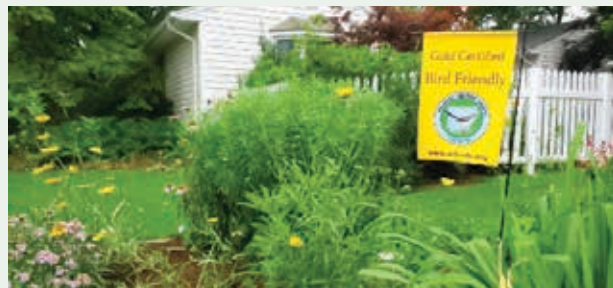
Arkansas Audubon Society's bird friendly yard.

Launched in 2016, Arkansas Audubon Society's Bird Friendly Yard (BFY) program has a vision of turning Arkansas into America's largest bird sanctuary by creating a statewide network of yards and parks planted with native flowers, shrubs, and trees. The BFY program also supports monarch and pollinator conservation, as bird-friendly yards are havens for native insects, too.