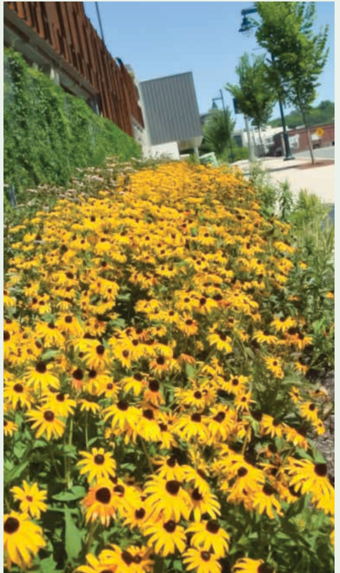
Fayetteville monarch habitat garden.

The City of Fayetteville has also planted several monarch butterfly habitats on public property in city parks, street medians and facility landscapes. These include: Wilson Park, Gulley Park, the College Avenue median and at the city's Sustainability Department located in the new Spring Street Parking Deck at the Walton Arts Center. These monarch gardens have a mixture of milkweed plants and flowering nectar-producing plants. Signs inform visitors of the purpose and functionality of the plants in these monarch gardens. Additional monarch gardens have been developed at public schools and local churches, and a demonstration garden is under construction at the Botanical Garden of the Ozarks.