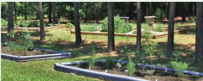
Pulaski Conservation District, NRCS School Pollinator Gardens.

Both gardens have progressed well since planting and are thriving. In total, over 500 plants were included in the gardens.