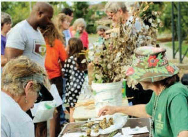
Pope County Master Gardeners table at ‘Go Native, Grow Native’ Event.

Presentations are provided on subjects such as beekeeping, the importance of pollinators, monarch and pollinator photography, control of invasive species and establishing native plants. The event continues to grow each year and is well attended.