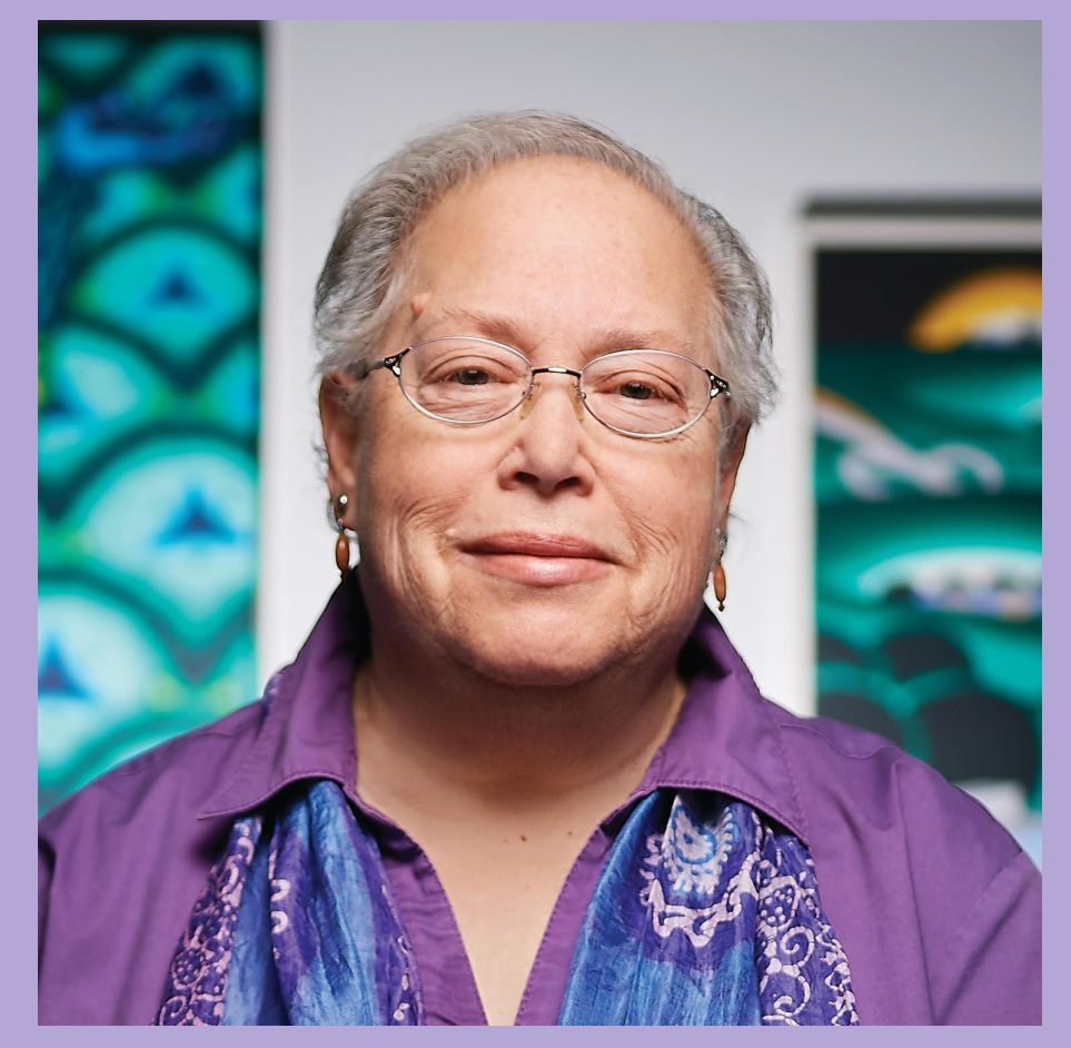
Suellen Rocca.

Recent tributes have been seen in the <u>New York</u> <u>Times</u>, Chicago Tribune, Artforum, and more.