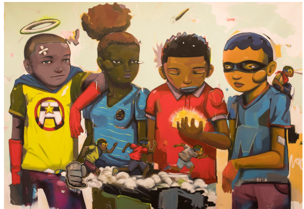
Hebru Brantley, Natural Alchemy , 2017, Mixed media on canvas, 63 x 90 ½ in.