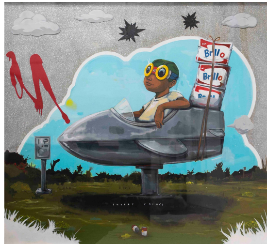
Hebru Brantley, Free From Personal Restraint , 2017, Mixed media and diamond dust on canvas, 54 x 59 1/4 in