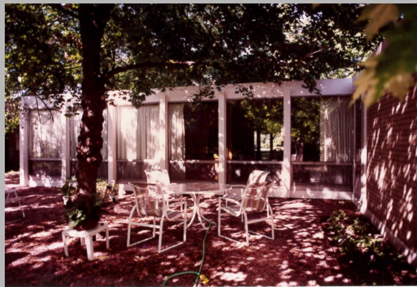
Archival photograph from the Fick Family, 1991