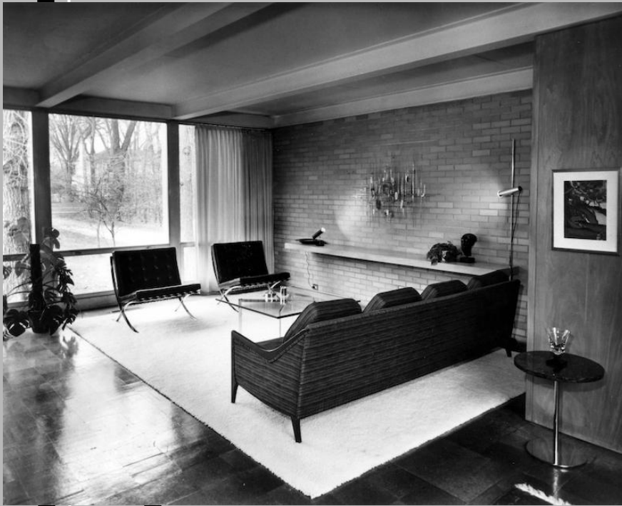
McCormick House, 1950s