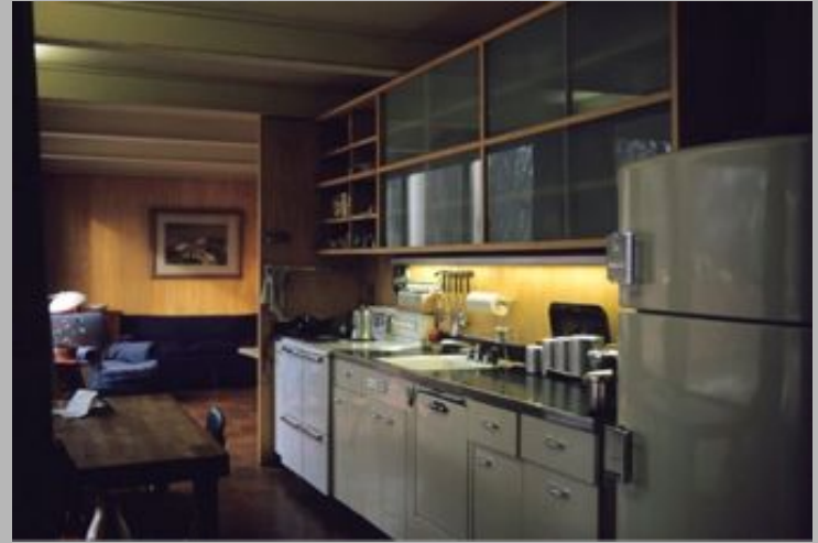
McCormick House kitchen, ca. 1965