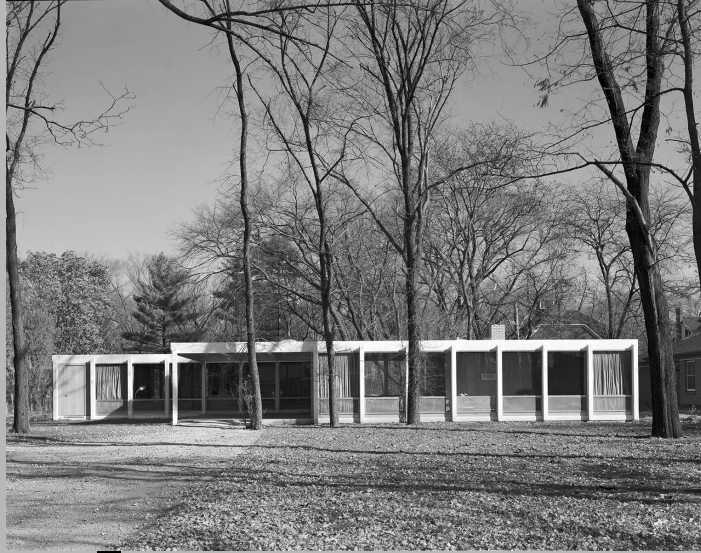
McCormick house view of front exterior, 1950s Hedrich Blessing Archive, HB15690B, Chicago Historical Society