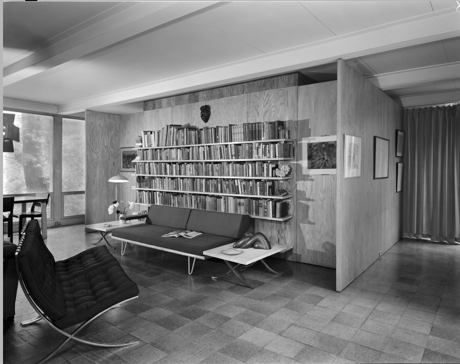
McCormick House, living room, 1950s, Hedrich Blessing Archive, HB17555A, Chicago Historical Society.

The McCormick House is an excellent example of Mid-Century Modern architecture by famed architect Mies van der Rohe, and one of only three houses he built during his three decades in America.