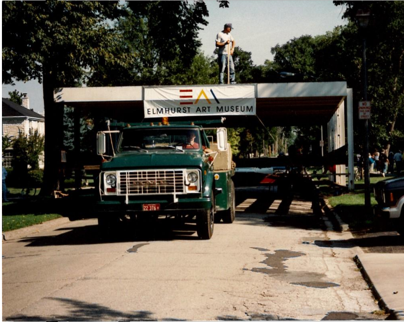
The McCormick House moved from 299 S Prospect Ave to its present location

In 1991 the Fick Family sold the McCormick House to the Elmhurst Fine Arts and Civic Center Foundation. The house was then moved a short distance to its current site in 1994 for its incorporation into a larger contemporary art complex. This unique opportunity influenced the museum's new building and tied the organization's mission to include the celebration of Mies's legacy through exhibitions and various programming.