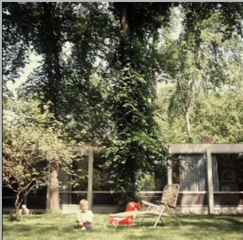
Archival photograph from the Fick Family