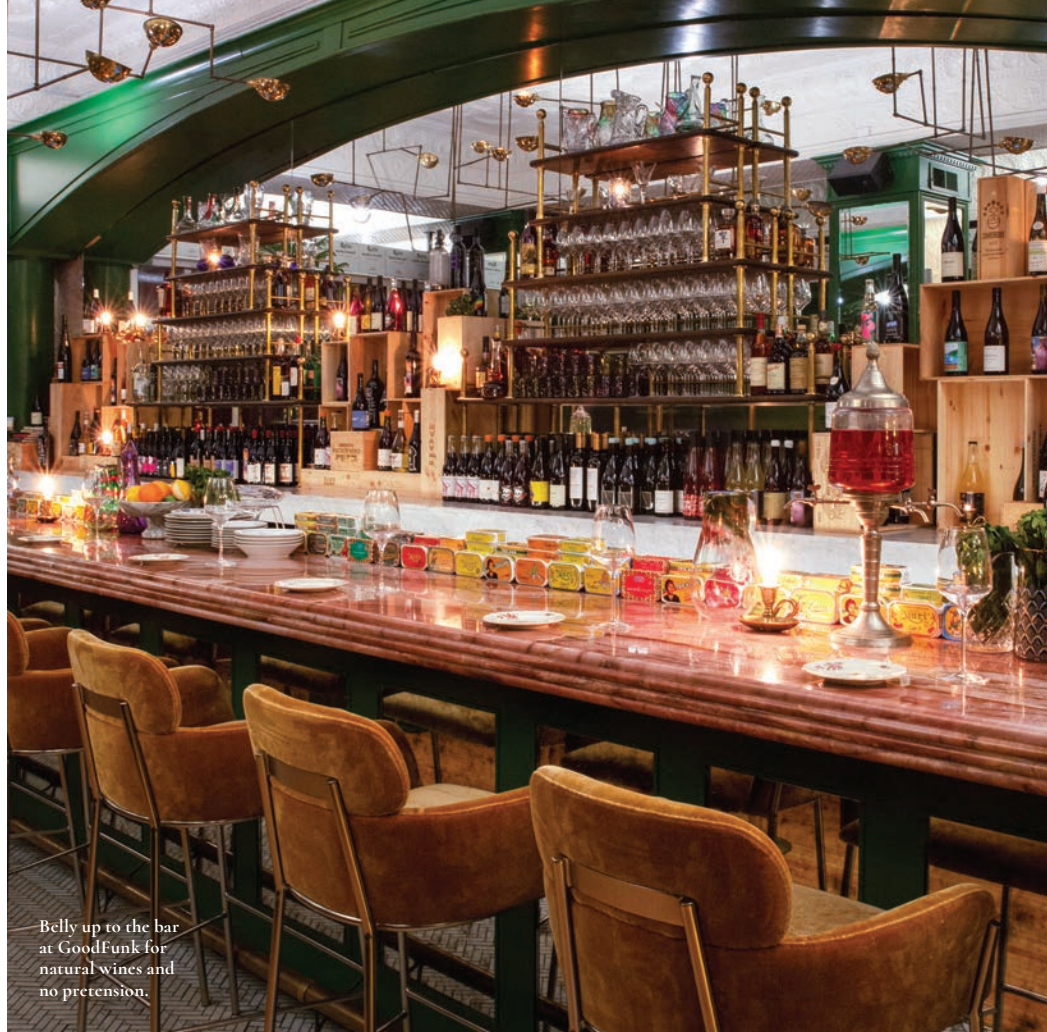
Belly up to the bar at GoodFunk for natural wines and no pretension.

GoodFunk will frequently change its by-the-glass and bottle offerings (sometimes daily, always weekly) for guests to savor new tastes each visit. Paired with equally funky, wine-friendly dishes like housemade charcuterie and Spanish-style flatbreads, GoodFunk reminds you wine can be affordable, quirky and, most importantly, fun. 180 N. Wacker Drive, goodfunkchicago.com