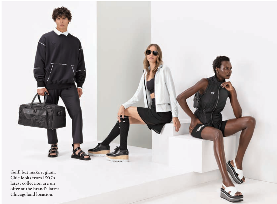
Golf, but make it glam: Chic looks from PXG's latest collection are on offer at the brand's latest Chicagoland location.