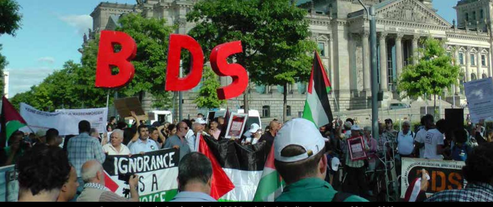
Protest against the Bundestag's Anti-BDS Resolution in Berlin, Germany on 28 June 2019