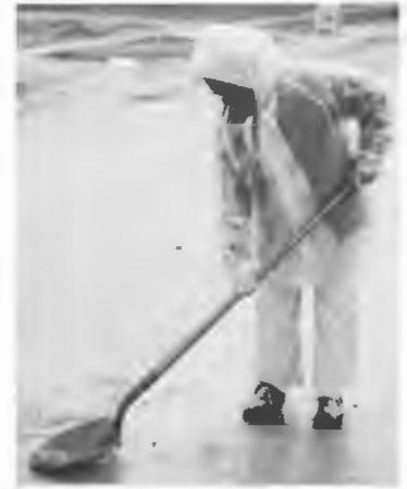
Volunteer borrowed shovel to clean up mud at Mass Mutual Aid Station.