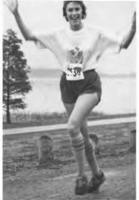
Running THE ROCK is FUN!!!