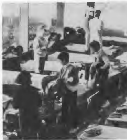
Medical facilities at finish line.