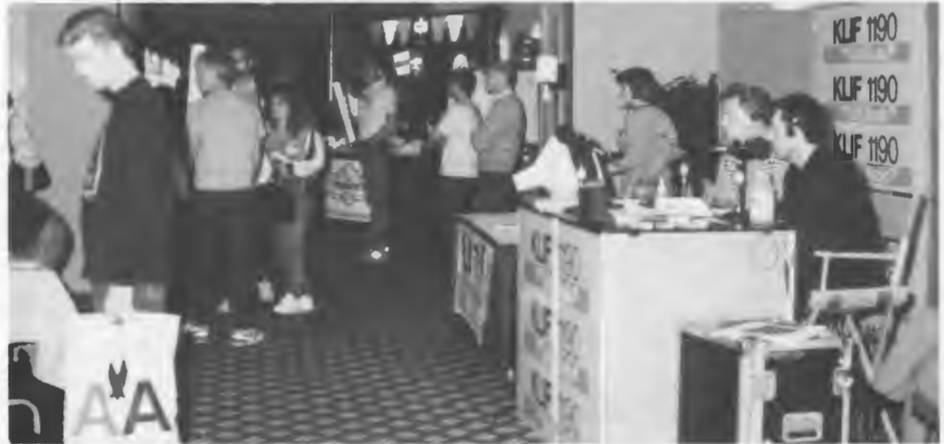
Live broadcast of Larry North show from Expo by KLIF 1190.