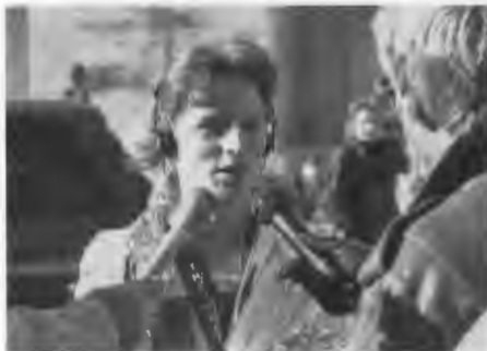
Media coverage has come of age.