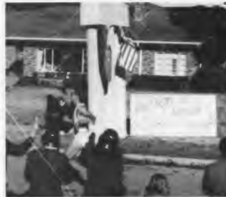
White Rock Athletic Club "Blitz the Wall" aid station—1st Non-Corporate Division.