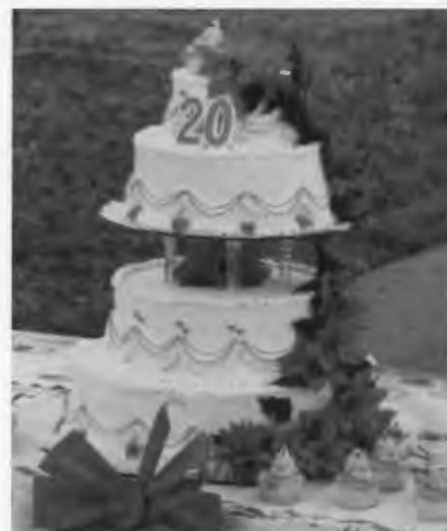
20th Anniversary cake.