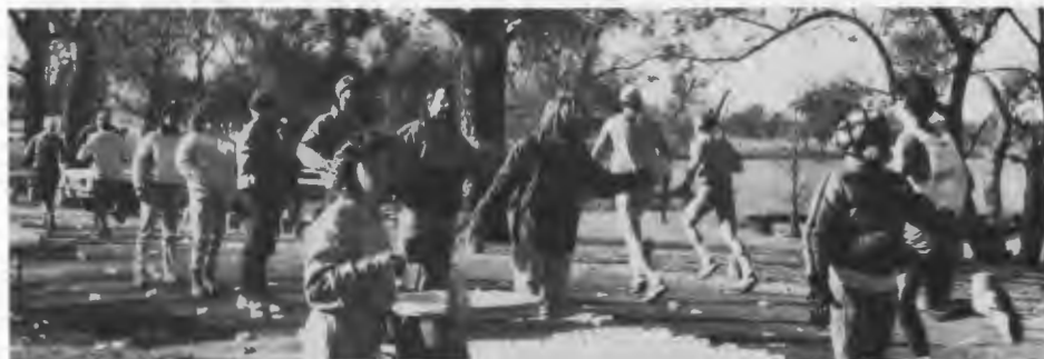
Mobil's 5th year providing aid station support.