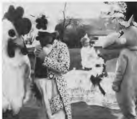
Mass Mutual aid station 20th Anniversary Celebration characters.