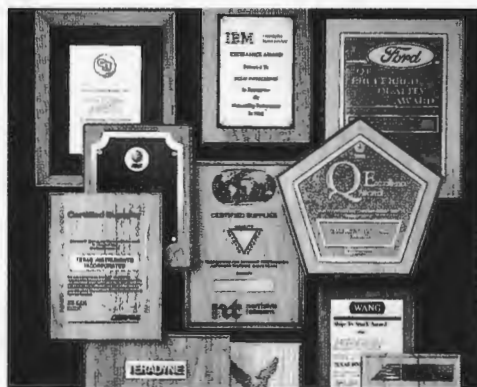
TI's numerous quality awards from customers and industry associations are testimony to our commitment to worldwide quality leadership.

That's why, at TI, quality is a total commitment — throughout every facet of our business, by every Tler. We have a commitment to total quality which