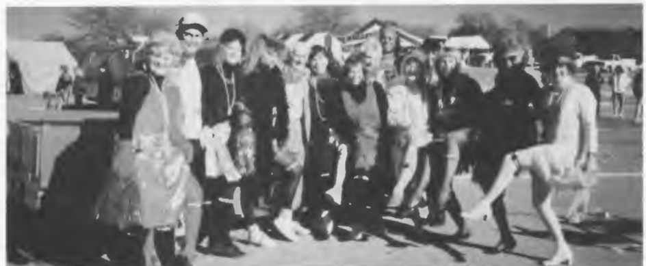
Texas Instruments/ARA aid station, winner—1st Corporate A Division.