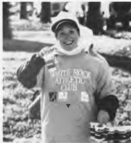
A cheerful volunteer at the White Rock Athletic Club aid station.