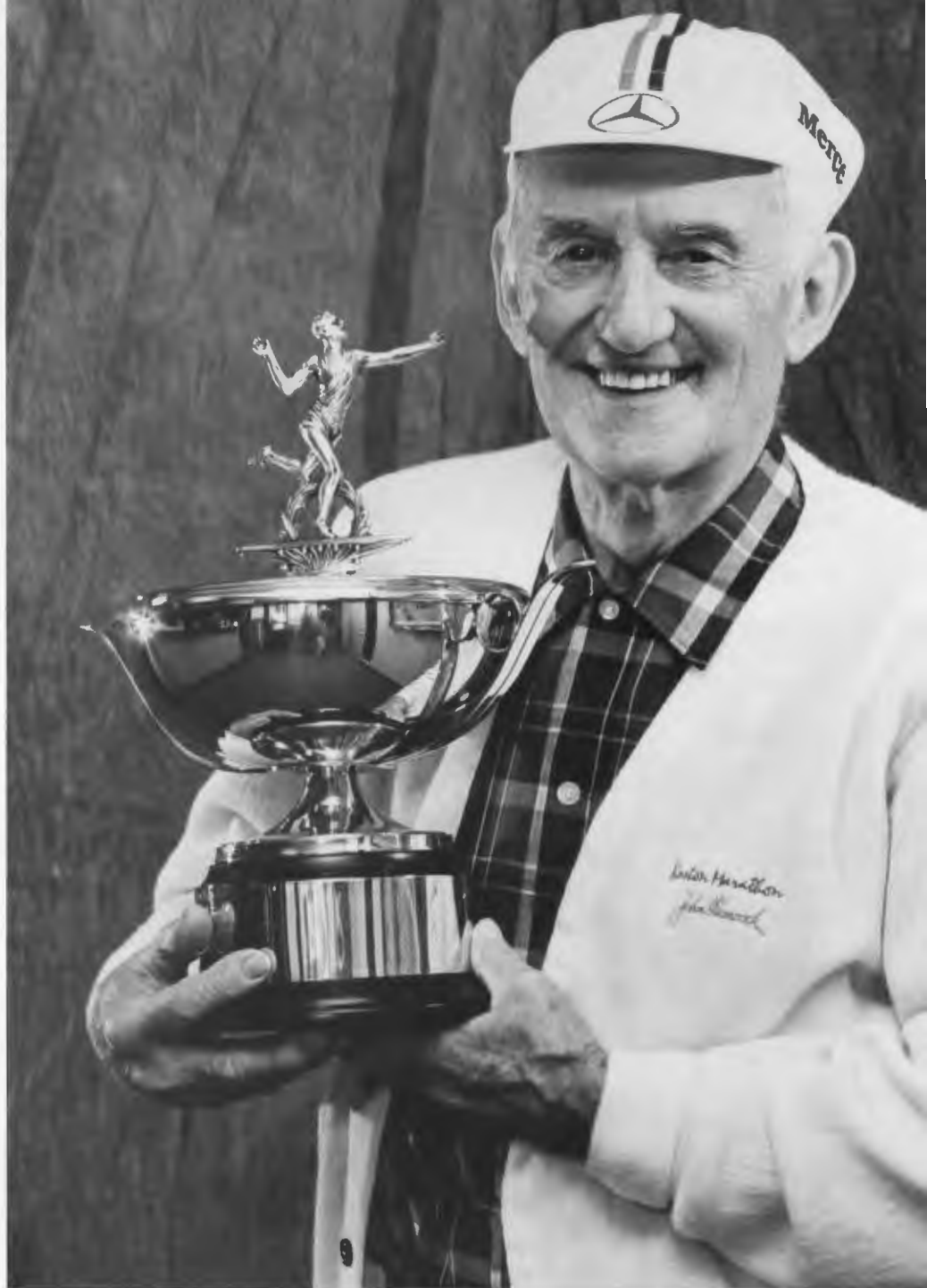
Johnny Kelley with his Award for Excellence.

He was twice the National AAU Marathon Champion and held seven other road race titles. He was the first