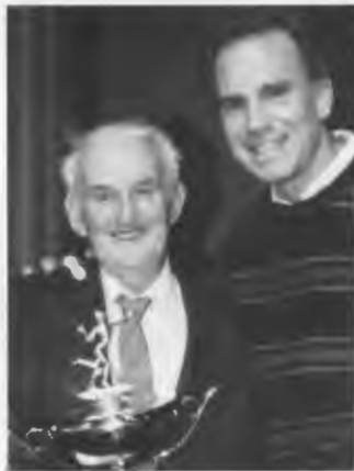
Johnny Kelley receives award from Roger Staubach.