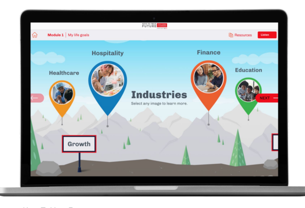
Keys To Your Future

Standards Alignment: ASCA Career Development Standards