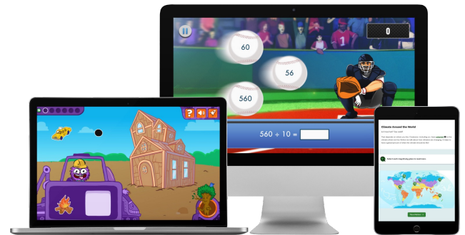
Library of Digital Courses for Elementary School

At EVERFI, we're passionate about whole-child learning and preparing students with real-world skills. For the past 15 years, we've built high-quality learning resources on topics like financial education, STEM, character education, career exploration, and health & wellness. Our free digital courses and accompanying resources help a network of 750,000+ educators champion real-world skills and empower the next gen to thrive in an ever-changing world.