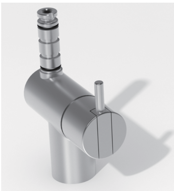
KV1-40: 1999 -