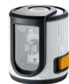
EasyCross-Laser + batteries