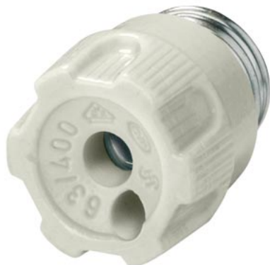
NEOZED screw cap Porcelain size D02, 63A with inspection hole