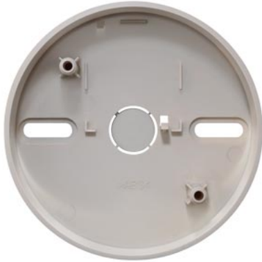
DELTA reflex, Surface mounting connection socket Dimensions 93x 27 mm titanium white