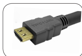
Solid copper shield and 15um thick 24Kt gold bladed contact pins