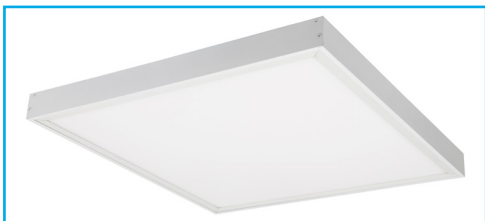
Shown with LED panel in a 600x600 surface mount frame