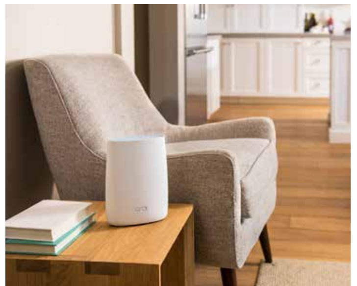
Orbi Satellite (RBS50)