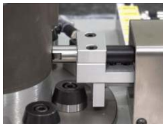
Automatic temperature compensation