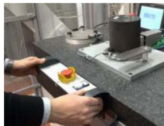
Manual cycle option