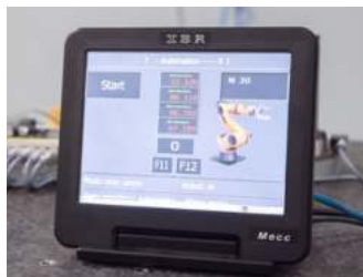
PC with Windows Embedded