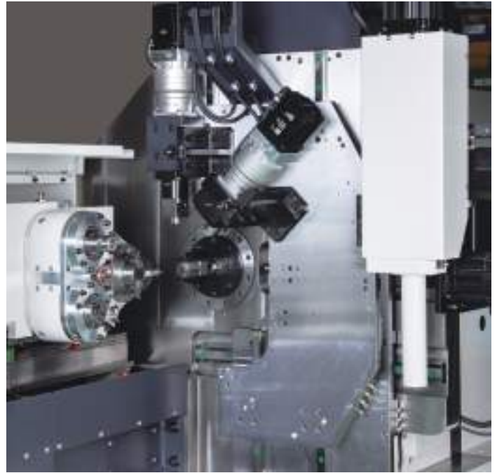
TRES Universal+Assist Slide

Various option units can be mounted on this table slide freely. Assist slide gives you the best layout for your production.