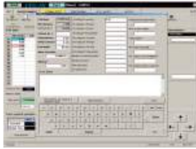
SETUP MEMO SCREEN

● A BASIC PROGRAM IS AUTOMATICALLY CREATED SIMPLY BY ENTERING THE SPRING DATA. 3D SPRING MODEL IS DISPLAYED ON THE SCREEN.