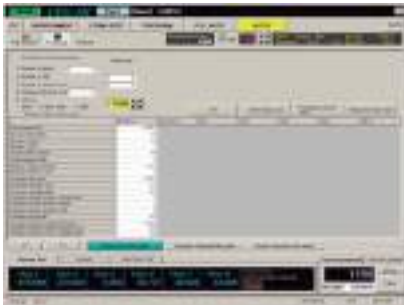
STATISTICAL GRAPHIC DISPLAY