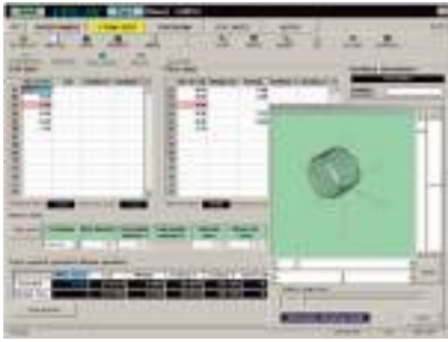
DATA ENTRY SCREEN