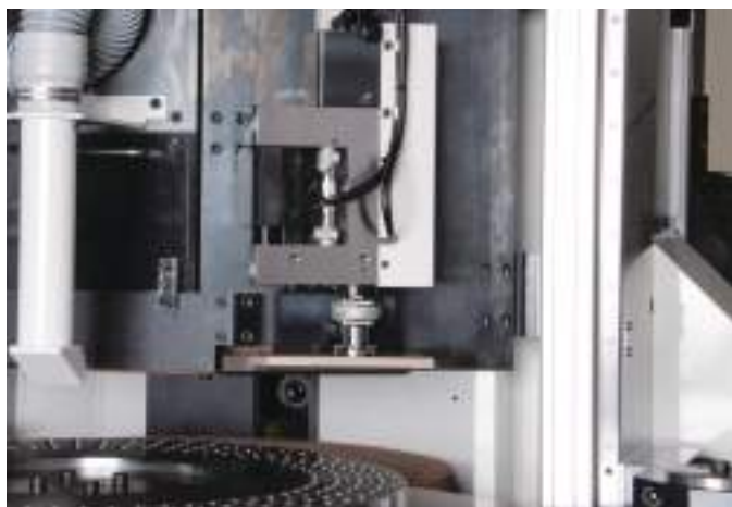
Free length measuring device: measures and monitors free length to control grinding amount