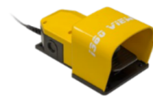
Foot pedal input