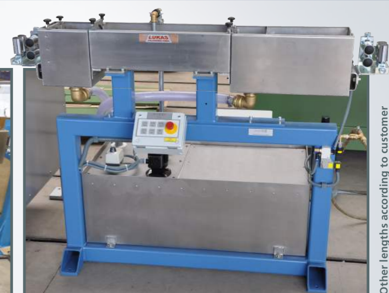
Water Cooling Device 500 mm (20 inch)

All water cooling devices equipped with blow-off nozzle for wire drying.