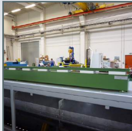
mounted on oven