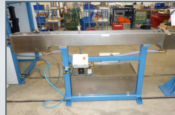
Water Cooling Device 1,500 mm (60 inch)