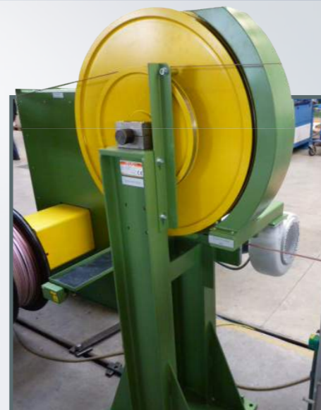
mounted on guiding pulley

Other mounting constructions according to customer requirements.