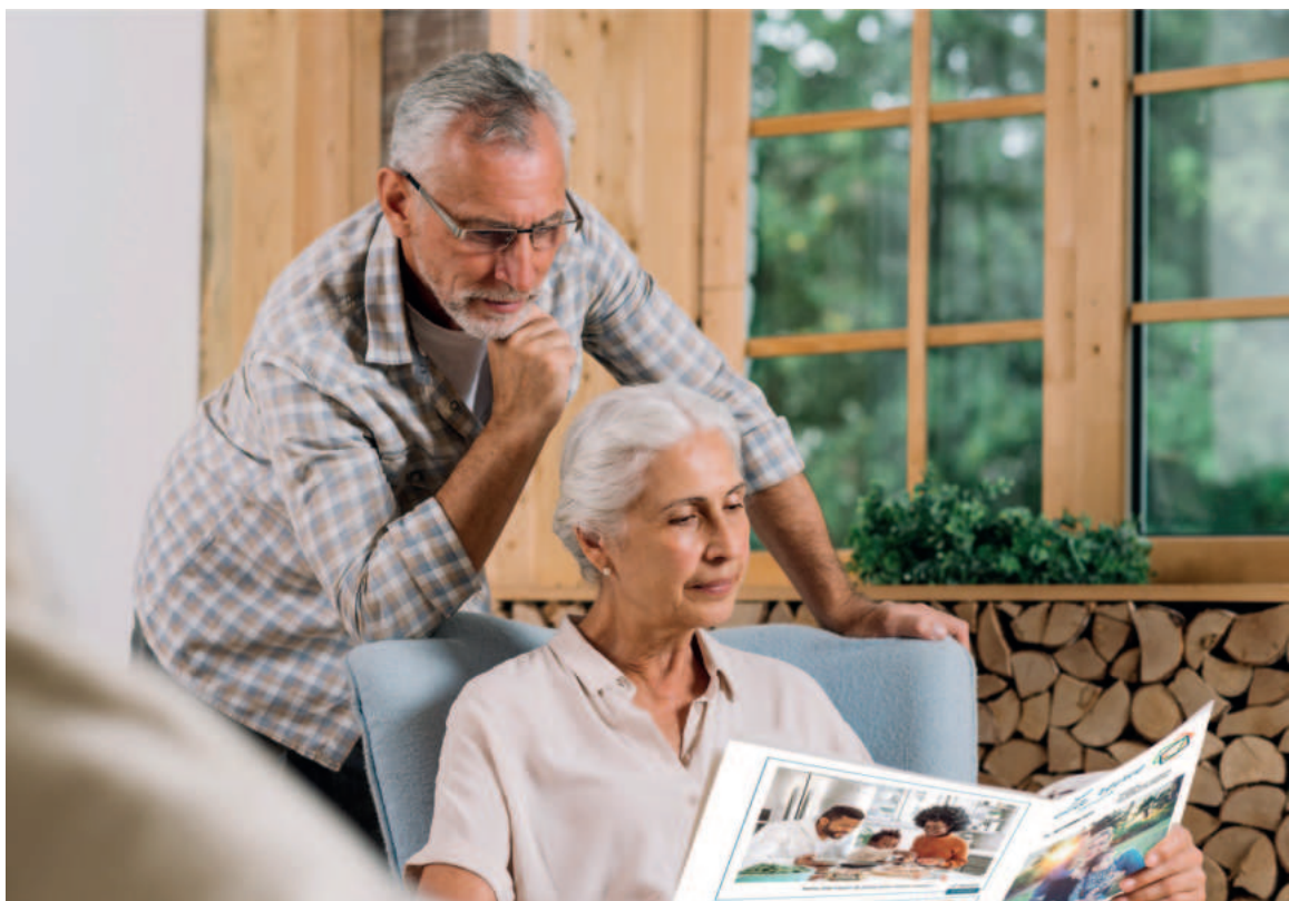
Grandma and Grandpa discover Familink magazine