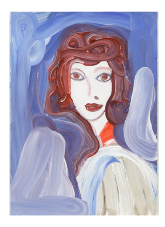
Tanya Ling Untitled June 2009 Acrylic paint on paper 42 x 29.5 cm 01425