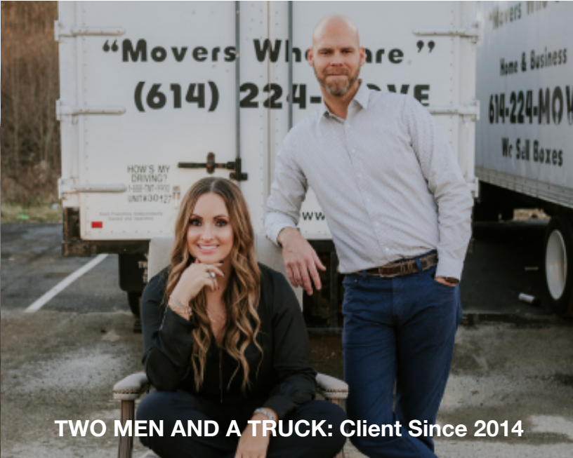
TWO MEN AND A TRUCK: Client Since 2014