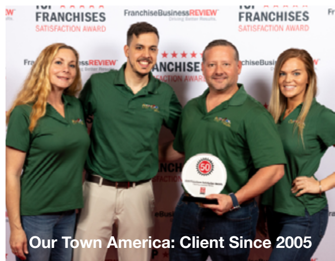
Our Town America: Client Since 2005