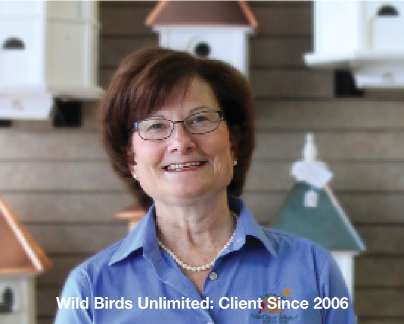
Wild Birds Unlimited: Client Since 2006