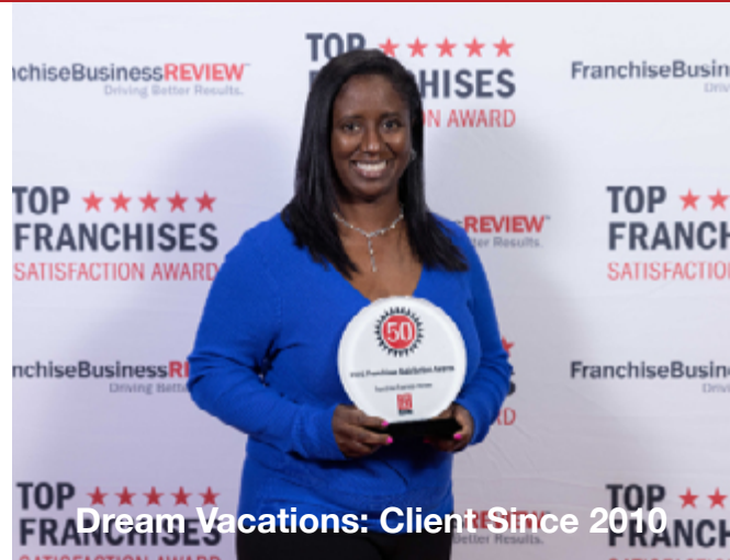
Dream Vacations: Client Since 2010