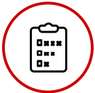
Franchisee satisfaction surveys

Franchise Business Review is about more than franchisee satisfaction. We can help you accelerate development and drive measurable results across your entire system.