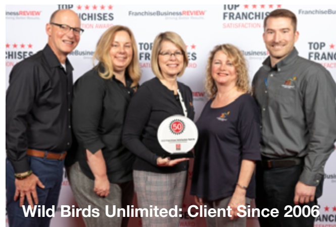
Wild Birds Unlimited: Client Since 2006