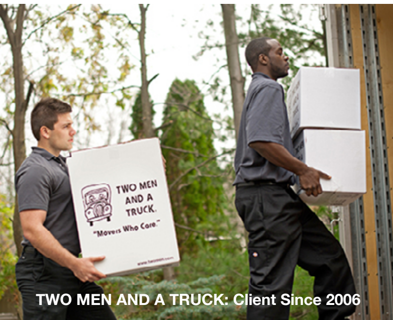
TWO MEN AND A TRUCK: Client Since 2006