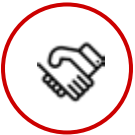
Employee engagement surveys