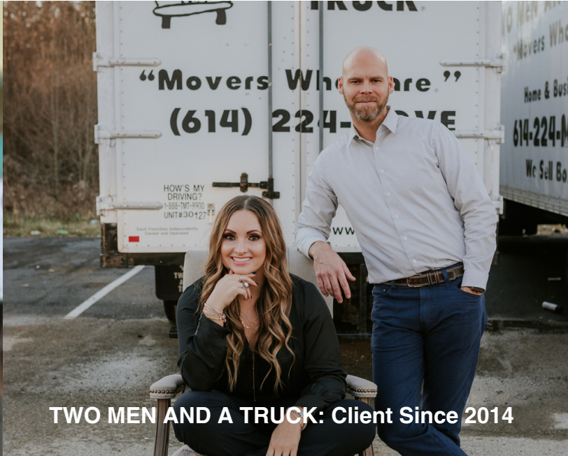
TWO MEN AND A TRUCK: Client Since 2014