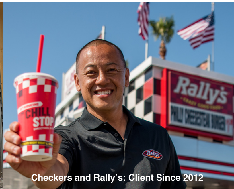
Checkers and Rally's: Client Since 2012