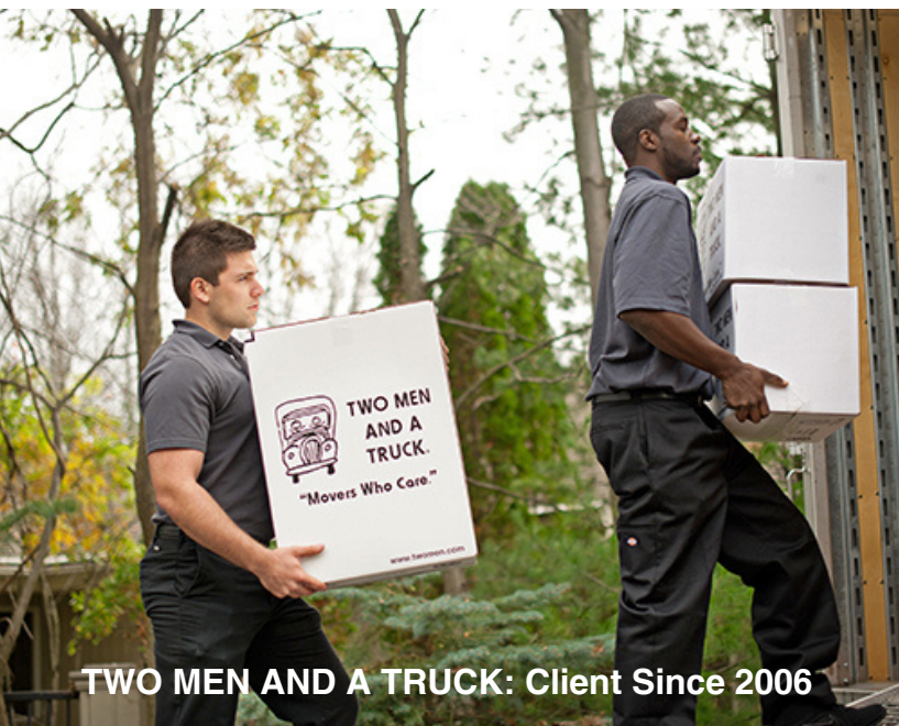
TWO MEN AND A TRUCK: Client Since 2006