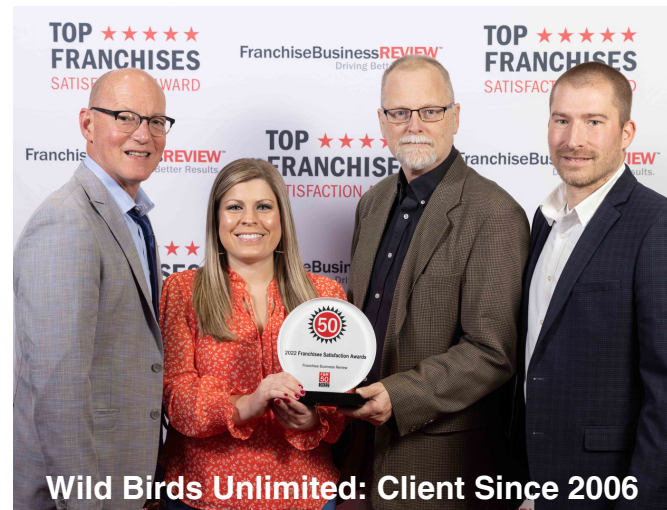
Wild Birds Unlimited: Client Since 2006