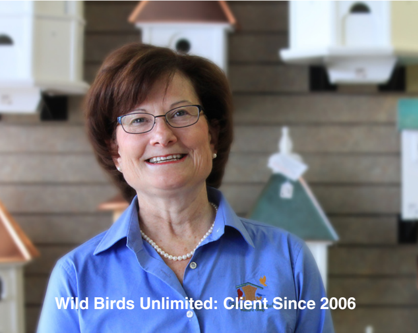
Wild Birds Unlimited: Client Since 2006