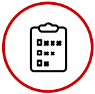
Franchisee satisfaction surveys

Franchise Business Review is about more than franchisee satisfaction. We can help you accelerate development and drive measurable results across your entire system.