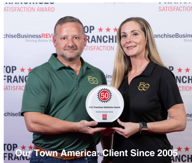
Our Town America: Client Since 2005