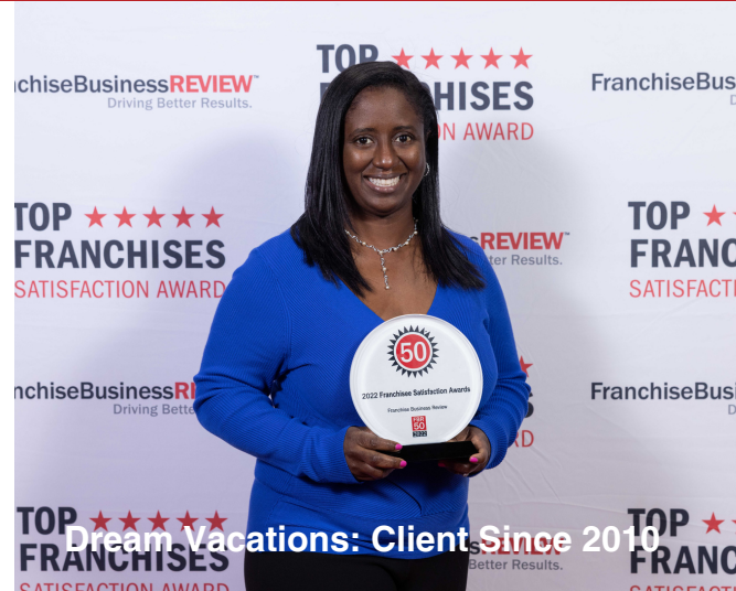
Dream Vacations: Client Since 2010