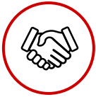
Employee engagement surveys