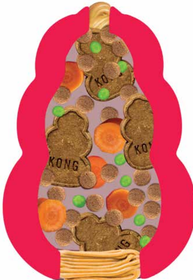
Medium Stuffed slightly tighter