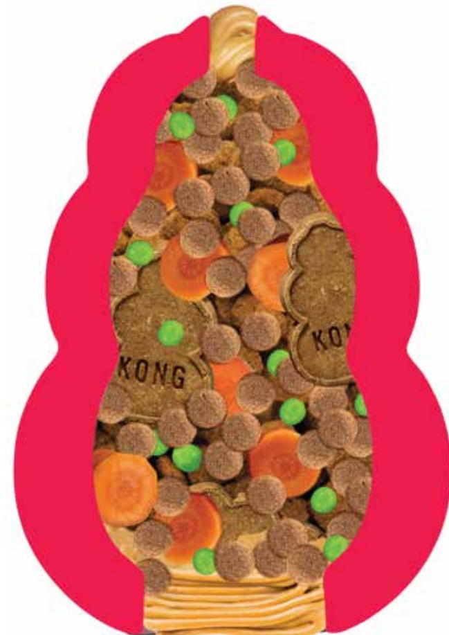
Hard Stuffed tightly