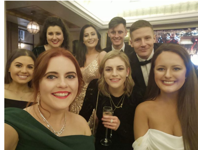
Left: The Calcutta run Right: Christmas Ball