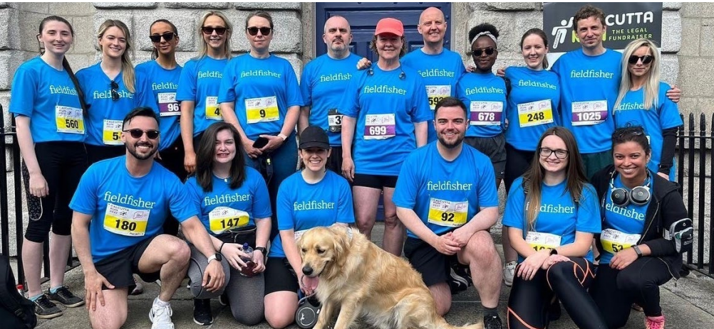
Above: The Calcutta run