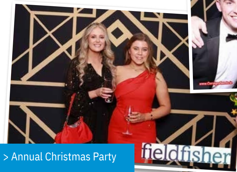
> Annual Christmas Party