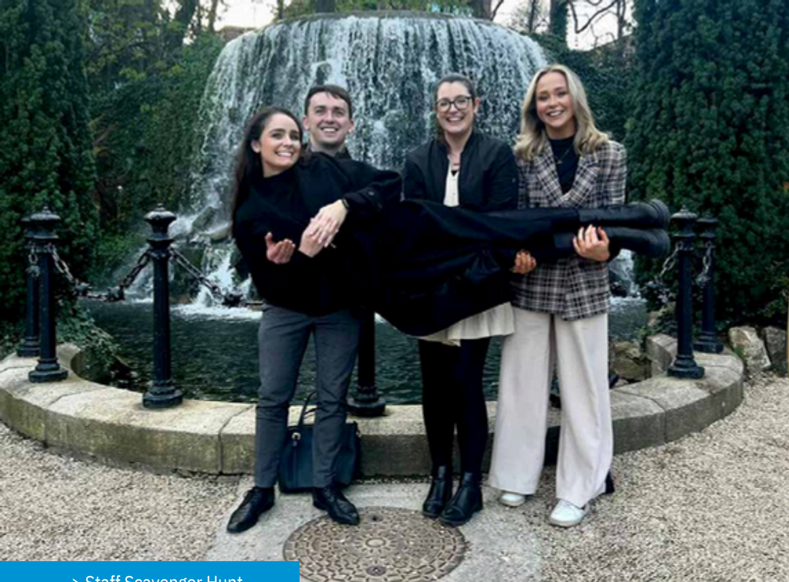
> Staff Scavenger Hunt