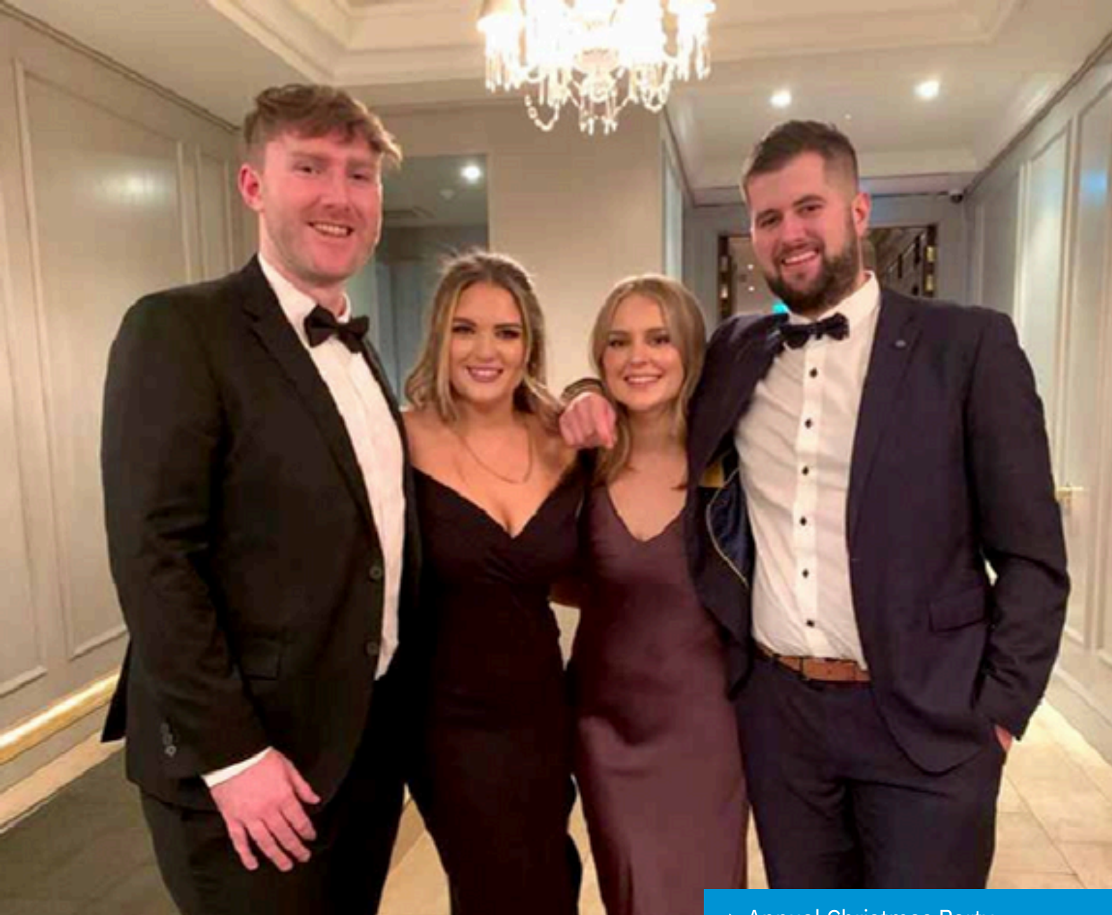
> Annual Christmas Party