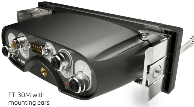
FT-30M with mounting ears